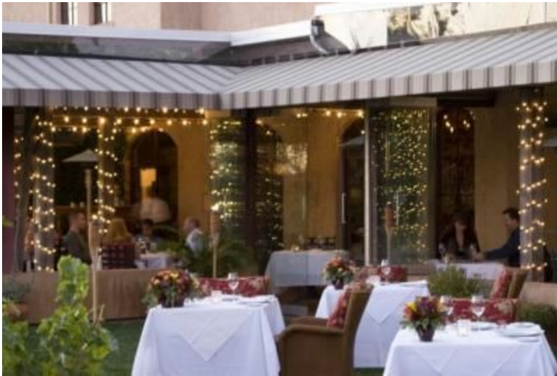
The Vintners Inn and John Ash & Co., the venerable fine-dining restaurant, are set on a 92-acre property planted with vineyards.

http://www.mercurynews.com/eat-drink-play/ci_29008444/inn-escapable-sonoma-wine-country-lodging-at-vintners