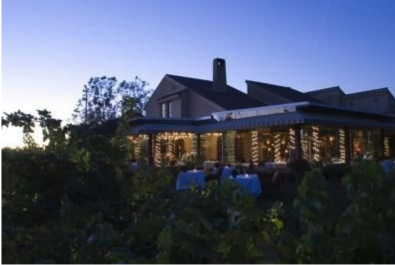
The Vintners Inn and John Ash & Co., the venerable fine-dining restaurant, are set on a 92-acre property planted with vineyards. (Vintners Inn)